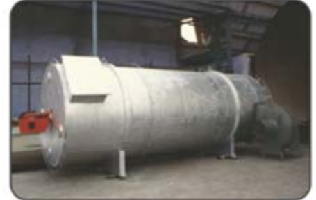
LDO / GAS FIRED