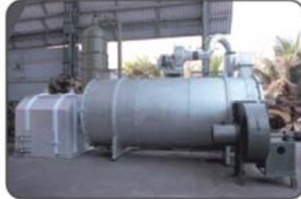
COAL / LIGNITE / WOOD FIRED