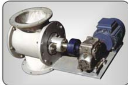
AIR LOCK ROTARY VALVES

Air Lock Rotary Valves available in various sizes and manufactured in Aluminum body or S.S. with necessary drive options.